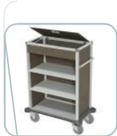
Amenities compartment lid