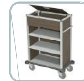
Amenities compartment lid and stationery drawer