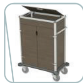
Amenities compartment lid and doors