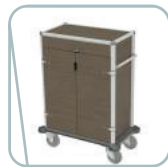
Amenities drawer and doors