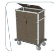
Amenities compartment lid, stationery drawer and doors