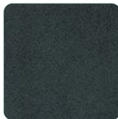
Black caviar look