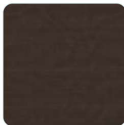
Wenge oak look