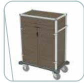
Amenities drawer, stationery drawer and doors