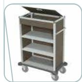
Amenities compartment lid