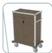
Amenities drawer and doors