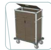
Amenities compartment lid, stationery drawer and doors