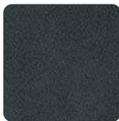
Black caviar look