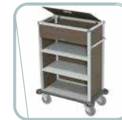
Amenities compartment lid and stationery drawer