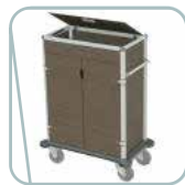
Amenities compartment lid and doors