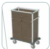
Stationery drawer and doors